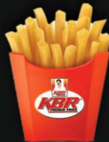
KBR FRENCH FRIES