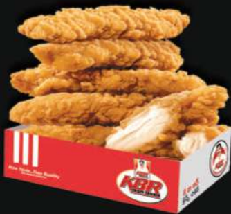
BONELESS CRISPY STRIPS