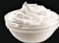
SOYA PEPP MAYONNAISE DIP