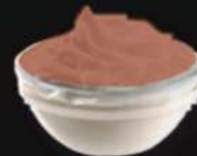
KBR SPL MAYONNAISE DIP