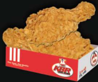
CRISPY LEG PIECE